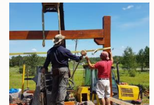
Building our future together