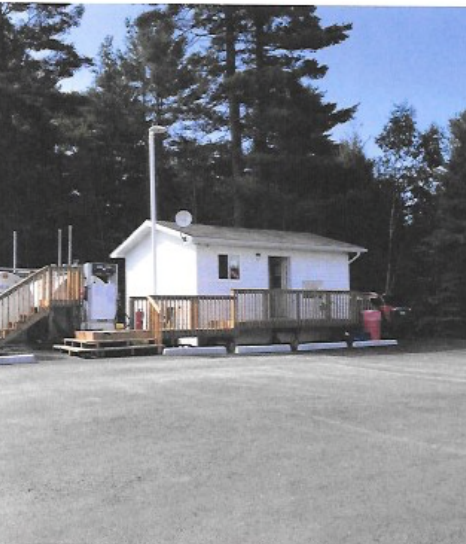
HIFN NEW GAS BAR...