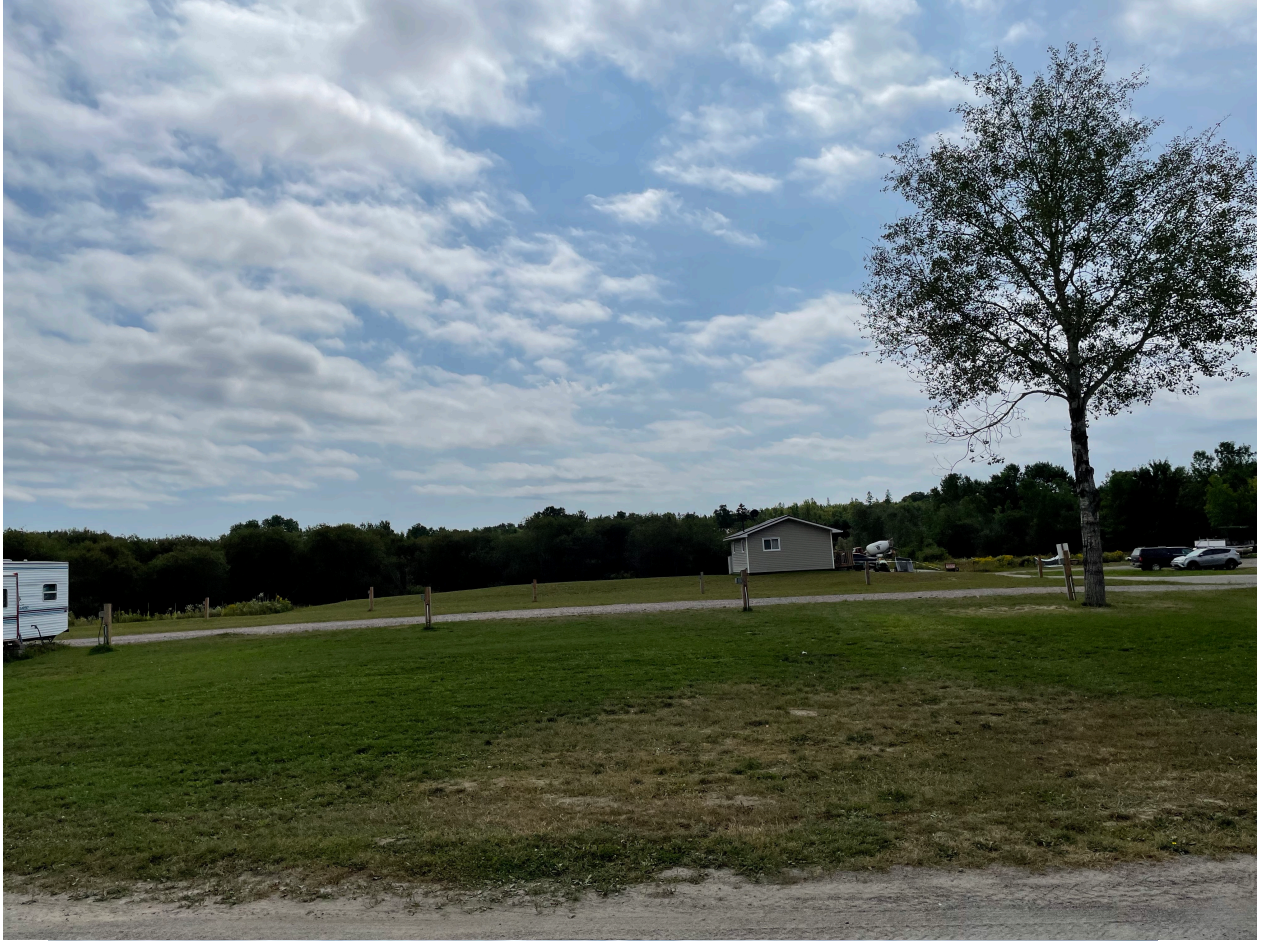
Lots at the Marina ready for next season