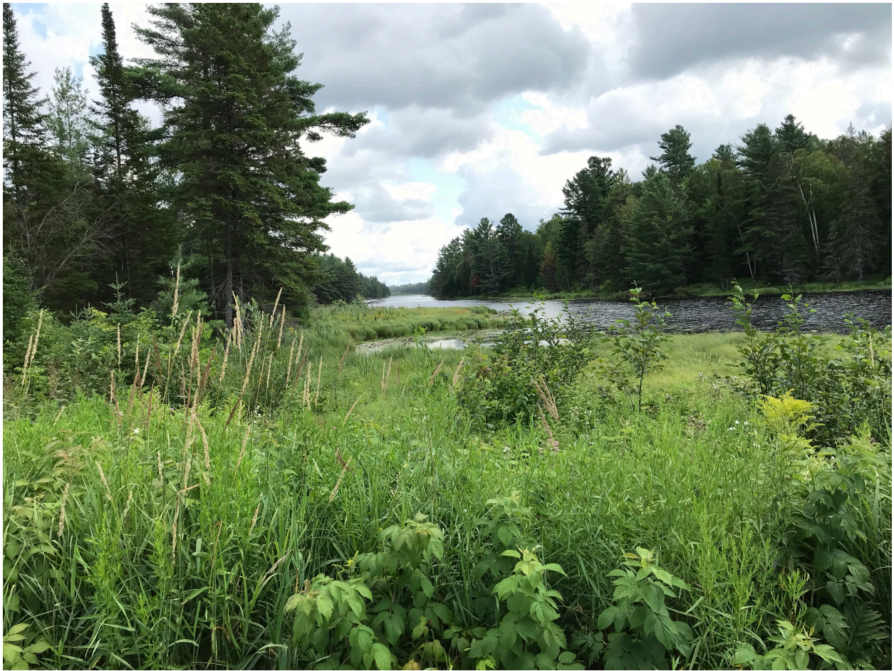
This shot is taken at the Gazebo