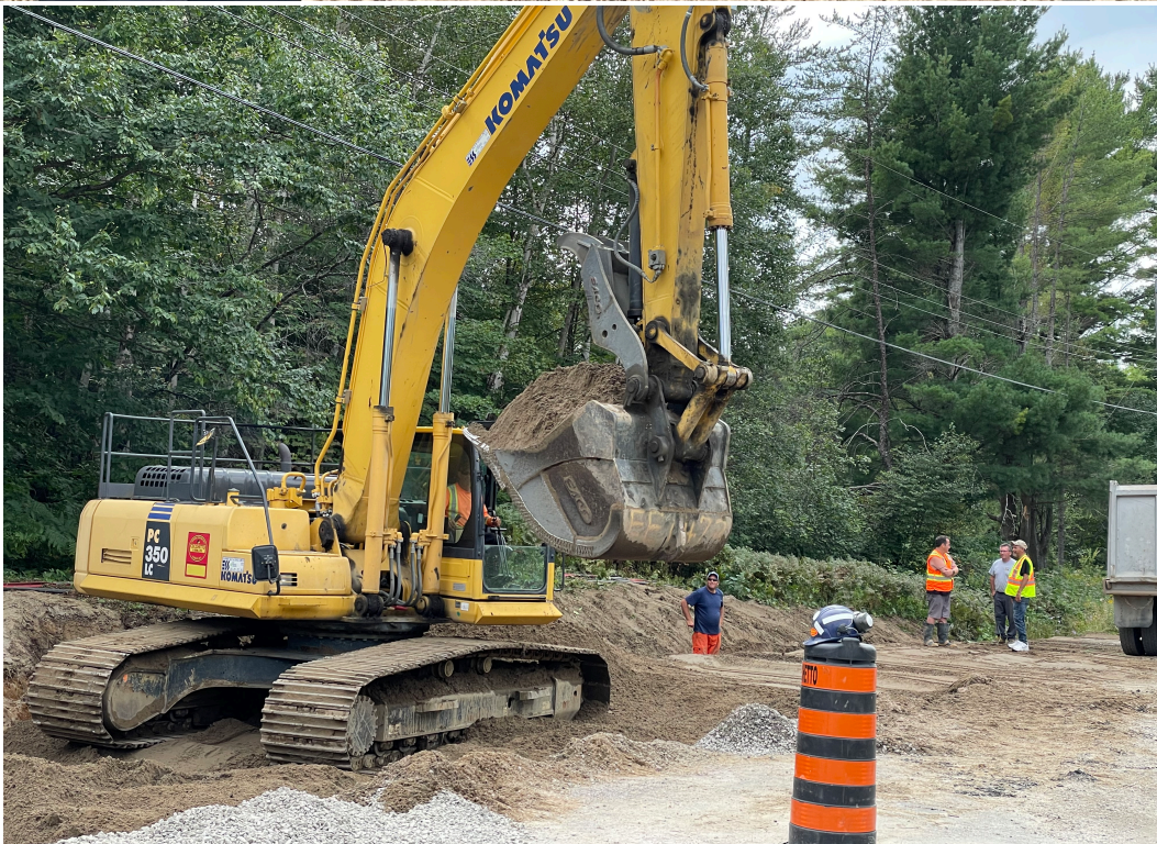
Water Main Break