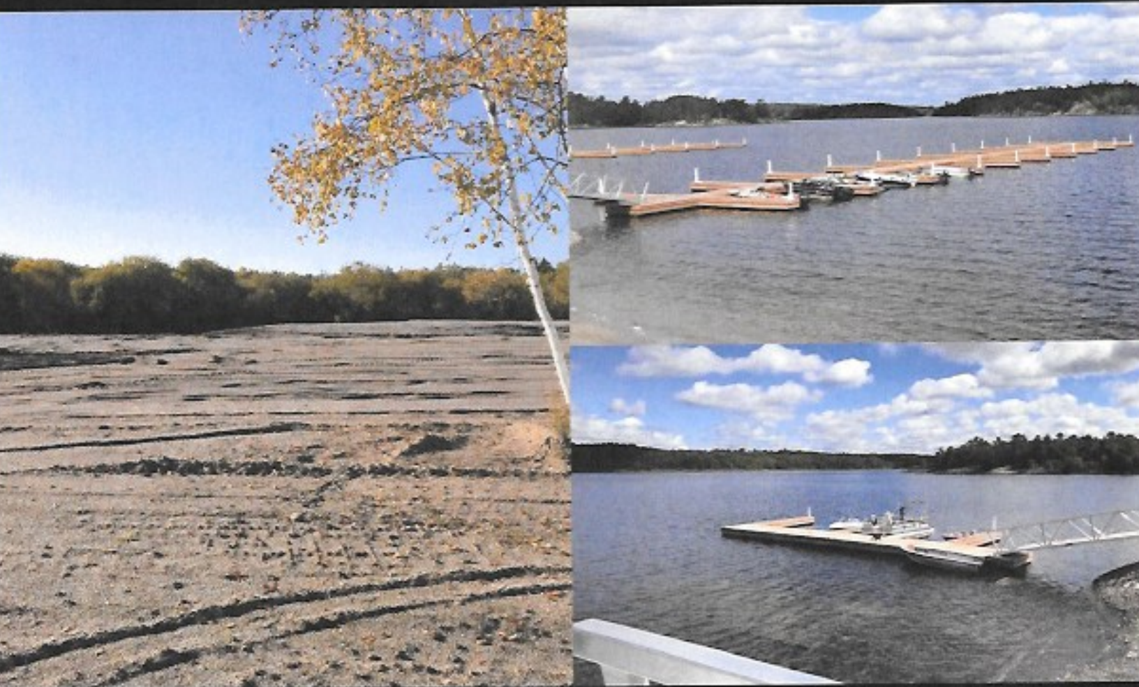
New Docking Facilities and Trailer Lots