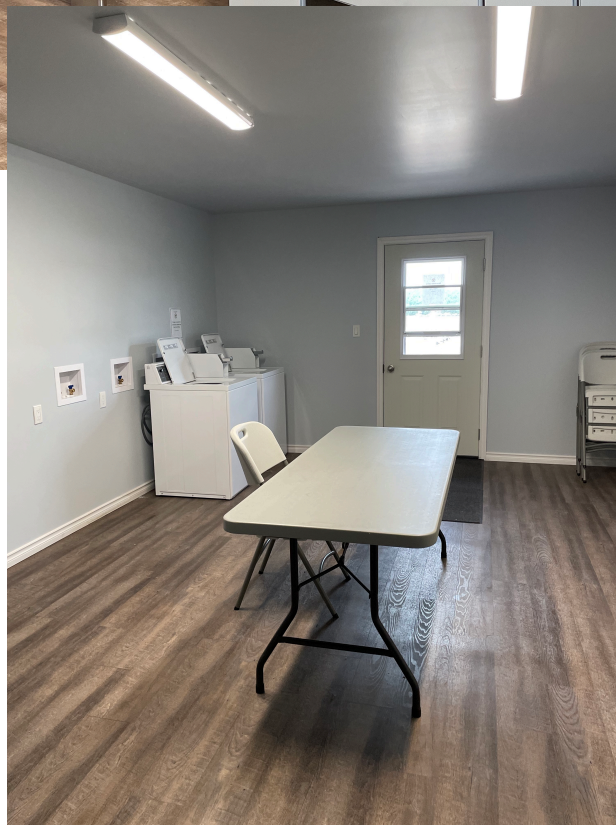
New Laundry Facility with washrooms and showers.